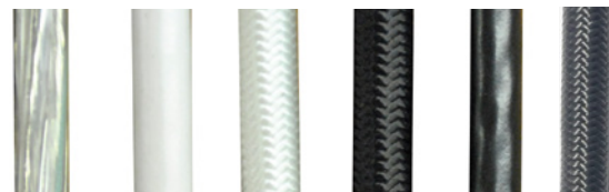
CLEAR PLASTIC -CP WHITE PLASTIC -WP WHITE CLOTH -WC BLACK CLOTH -BC BLACK PLASTIC -BP GREY CLOTH -GC