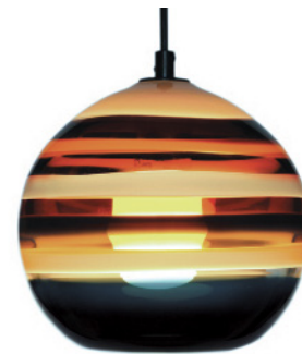
amber orb 25-44-53 9"T x 9"W