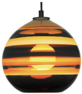
mustard orb 25-44-120 9"T x 9"W