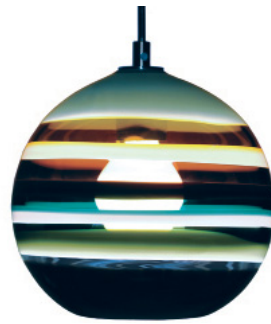
stone orb 25-44-122 9"T x 9"W