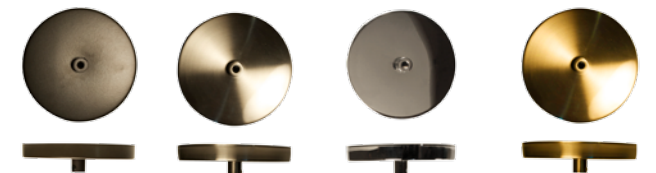
DARK BRONZE -BZ SATIN NICKEL -SN POLISHED NICKEL -PN BRUSHED BRASS -BB

*For pipe and chain options, please view additional options page.