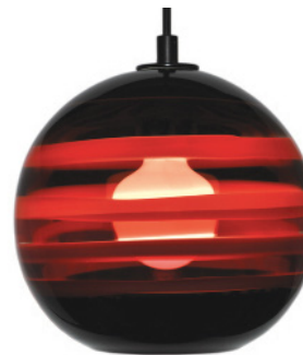
scarlet orb 25-44-54 9"T x 9"W