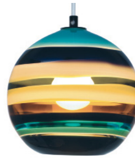
aqua orb 25-44-51 9"T x 9"W