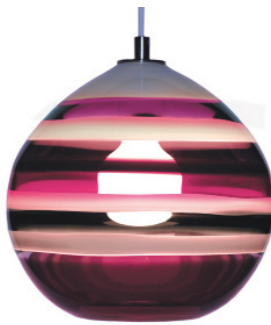
amethyst orb 25-44-52 9"T x 9"W