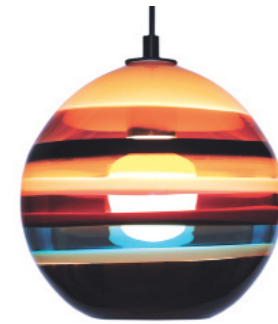
cranberry orb 25-44-41 9"T x 9"W